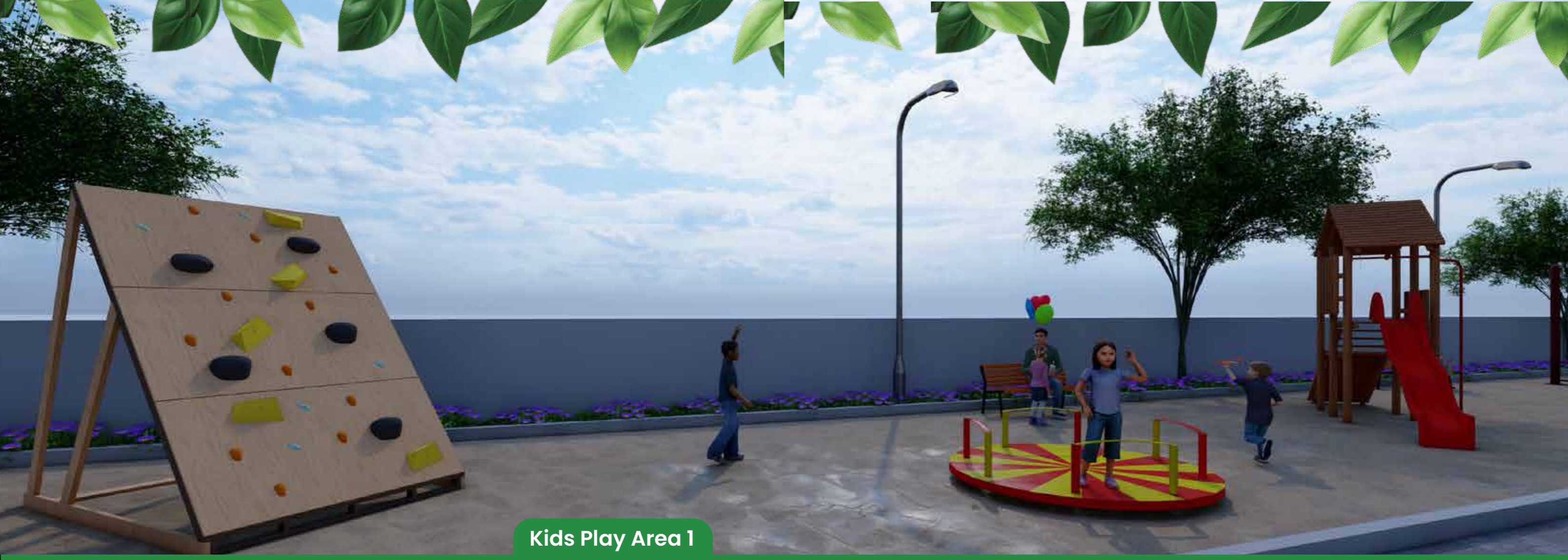
Kids Play Area 1