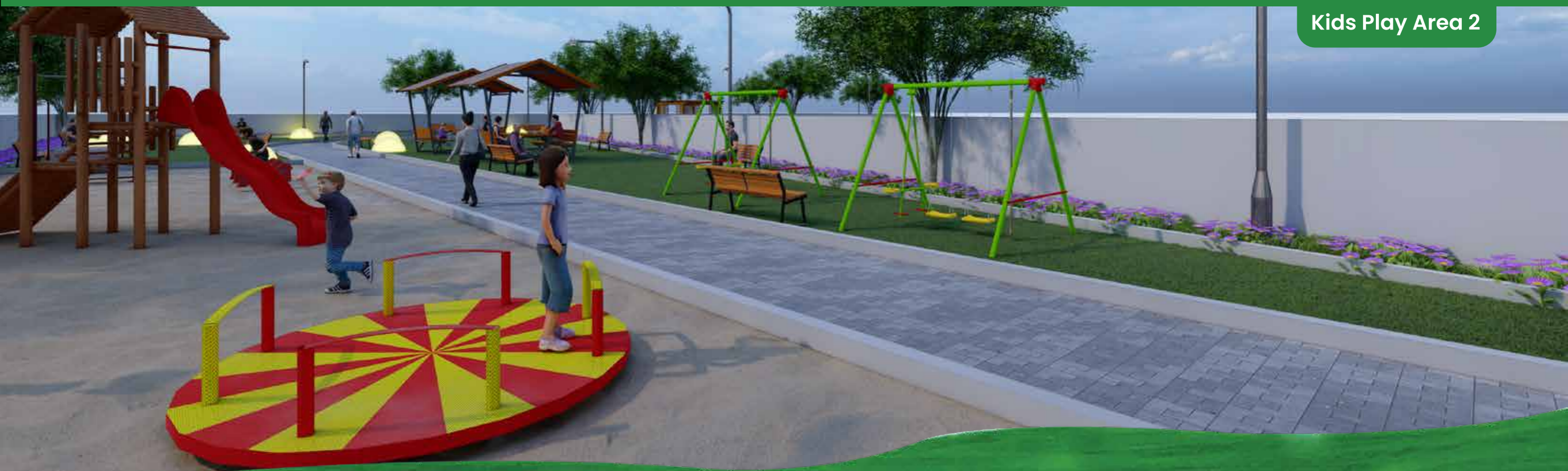
Kids Play Area 2